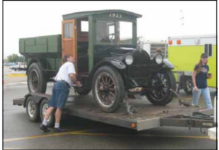
Early morning photos reveal wet parking lot from overnight rain (above and below)