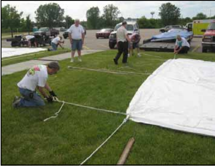
Set-up begins Friday night - tent stakes are being set