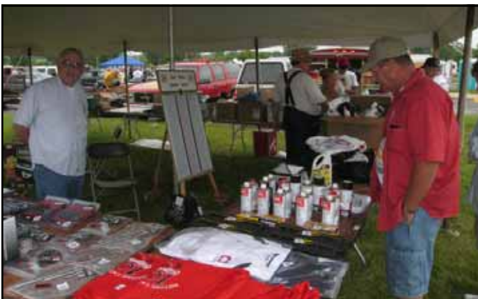
The door prize tent was busy most of the day