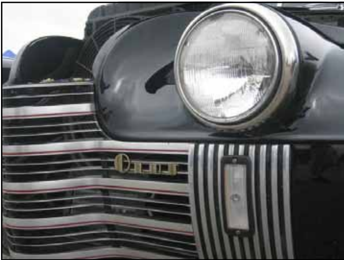
In the air, and up close - everywhere you look - beautiful Oldsmobiles!