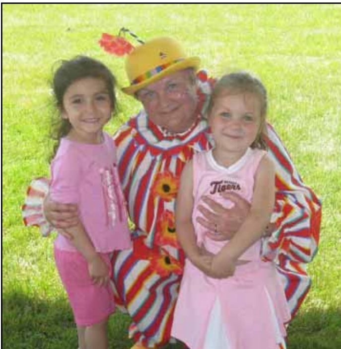
Our goodwill ambassador (and Clown/President) hard at work spreading the Oldsmobile joy