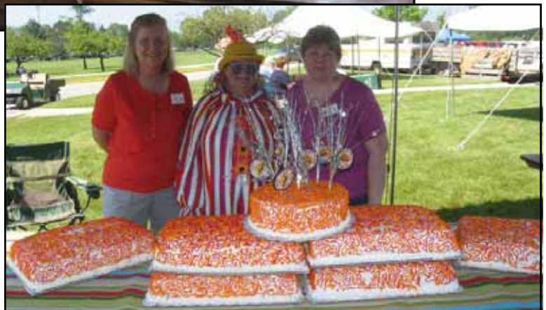
... and the next day, you have cake for the masses.