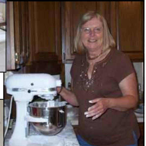
These ladies are REALLY into their work!