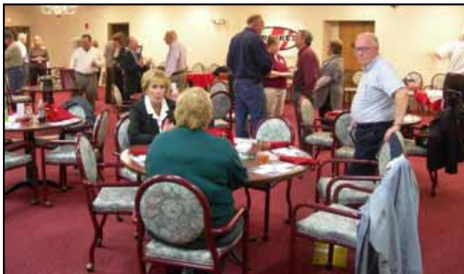
Members and guests mingle before the meal.