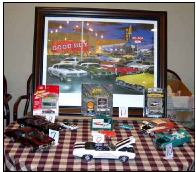
Several members contributed to this Oldsmobile model display.