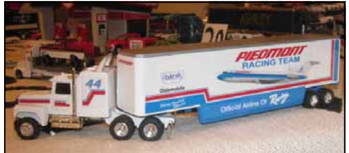
Above and left - Ashley Jones impressive car hauler display.