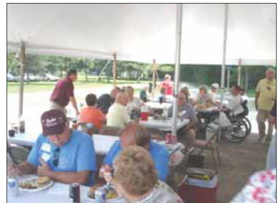
2009 Chapter picnic at the Museum